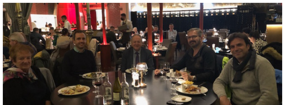
Dublin, Ireland, December 2021.